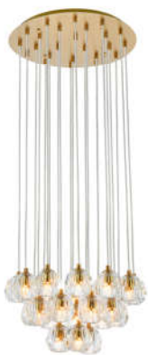
Gold Item No:3505G19G