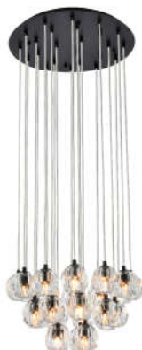
Black Item No:3505G19BK